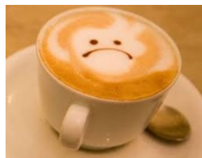
Sad coffee – no one signed up for coffee hour

Coffee Hour is a great time to say hello to others and grab a bite to eat with friends and soon-to-be friends. This is an important way to welcome newcomers and strengthen ties with other parishioners. Fancy food is not required, and the Weekend Sexton will help with set-up and coffee. Please sign up this Sunday to host coffee hour in the Old Well Hall. Everyone will be glad you did.